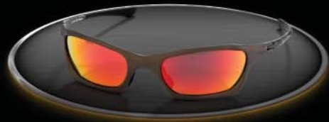
FORGE :: Olive Frames | Red Mirror Lenses 90853-80000 UPC :: 0 78371 90853 9