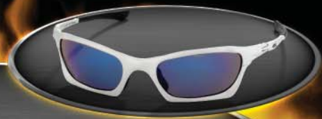
FORGE :: Silver Frames | Blue Mirror Lenses 90854-80000 UPC :: 0 78371 90854 6