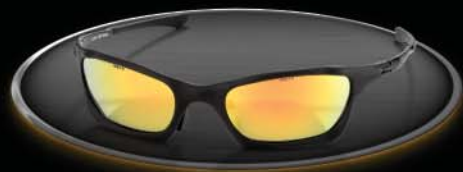
FORGE :: Black Frames | Yellow Mirror Lenses 90852-80000 UPC :: 0 78371 90852 2